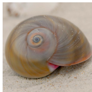
Shark Eye Moon Snail