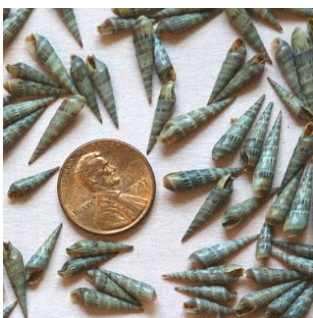
Grey Atlantic Auger