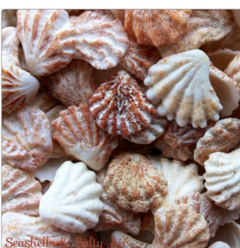
Atlantic Kitten Paw