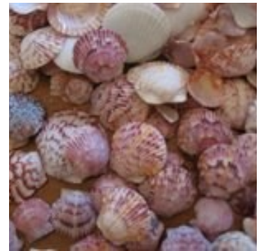
Atlantic Calico Scallop