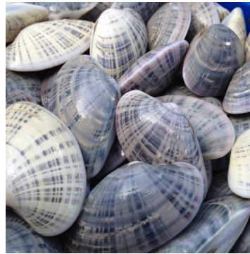
Sunray Venus Clam