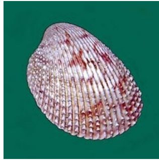
Florida Prickly Cockle