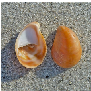
Common Atlantic Slipper