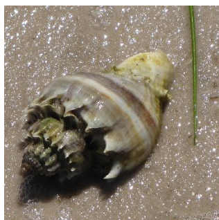
King Crown Conch