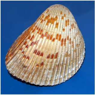
Atlantic Giant Cockle