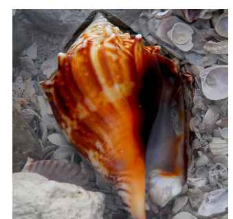
Florida Fighting Conch